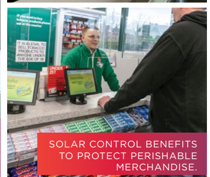
SOLAR CONTROL BENEFITS TO PROTECT PERISHABLE MERCHANDISE.