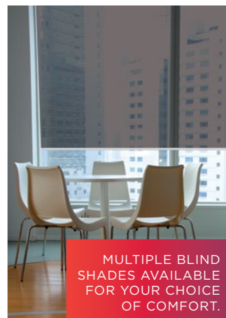
MULTIPLE BLIND SHADES AVAILABLE FOR YOUR CHOICE OF COMFORT.