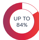
Solar Heat Energy Rejection