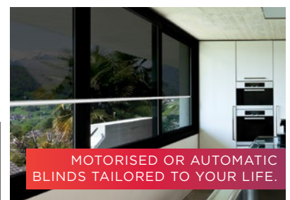
MOTORISED OR AUTOMATIC BLINDS TAILORED TO YOUR LIFE.