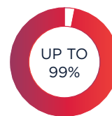
UV Ray Rejection